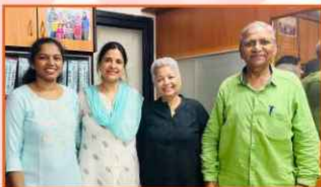
Discussion with Kayakalp's founder to expand support for girls in Pune's red-light districts

Launching Kanyathon Karshala Kendra to provide training for women in sewing, stitching, and various art forms. This initiative aims to empower women from rural areas by equipping them with practical skills that enable them to earn a sustainable livelihood and achieve financial independence.