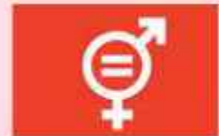
SDG 5: Gender Equality