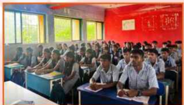
Work in progress to open a new KSK at Ashramshala, Pingalas