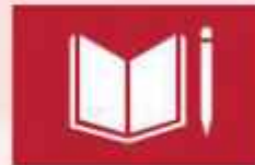
SDG 4: Quality Education