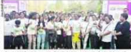
ಕನ್ಯಾಧಾನ್‌ಗೆ ಬೆಂಬಲವನ್ನು ತಿಳಿಸಿದವರ ಸಂಖ್ಯೆ 8 ಸಾವಿರಕ್ಕೂ ಹೆಚ್ಚು.

● ಬೆಂಗಳೂರಿನಲ್ಲಿ ನಡೆಸಿದ ಎಲೆಕ್ಟ್ರಾನಿಕ್ ಸಿಟಿಯಲ್ಲಿ ಕನ್ಯಾಧಾನ್ ಕಾರ್ಯಕ್ರಮದ ಸಂದರ್ಭದಲ್ಲಿ, ಹಲವಾರು ಮಕ್ಕಳು ಮತ್ತು ವಿದ್ಯಾರ್ಥಿನಿಧಿಗಳು ಭಾಗವಹಿಸಿ, ಕನ್ಯಾಧಾನ್‌ಗೆ ಬೆಂಬಲವನ್ನು ತಿಳಿಸಿದರು. ಈ ಸಂದರ್ಭದಲ್ಲಿ, ಕನ್ಯಾಧಾನ್‌ಗೆ ಬೆಂಬಲವನ್ನು ತಿಳಿಸಿದವರ ಸಂಖ್ಯೆ 8 ಸಾವಿರಕ್ಕೂ ಹೆಚ್ಚು.