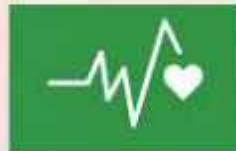
SDG 3: Good Health and Well-being

Kanyathon is committed to these United Nations Sustainable Development Goals (SDGs):